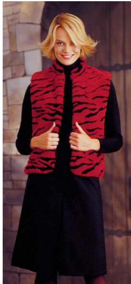
Misses' vests and culottes. Lined vest has hidden hook and eye closure. View A has stand-up collar, View B has V-neckline. Culottes in two lengths have inverted pleat at center front and center back, darts, back zipper and waistband with hook and eye closure.